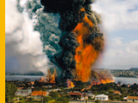
A mock volcano 'erupts' in Auckland during 'Exercise Ruaumoko'.