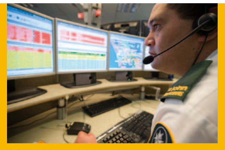
The focus over the past year in the nations ambulance communications environment has been on consolidating and building on improvements.

The ultimate benefits of our totally upgraded communications centre environment are significant, including improved outcomes for patients, ambulance providers and funders; consistent service; and consistent national data collection for the first time.