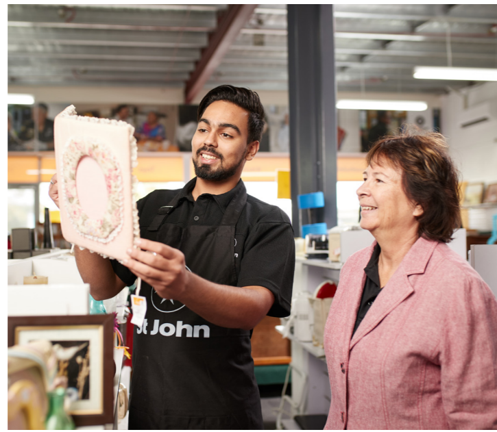
St John Op Shop – Henderson

With stores from Russell to Invercargill, pop in to donate, volunteer or shop – and find out why we're New Zealand's most trusted charity. If you'd like more information on a specific location please visit www.stjohn.org.nz/Shop/opportunity-shops/ ■