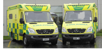
The 'twins' side by side